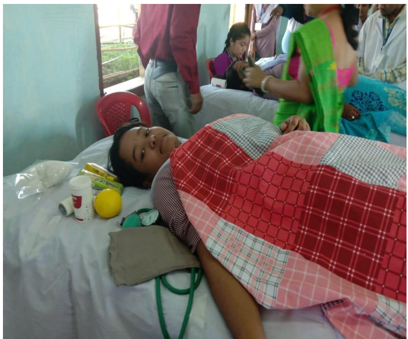
Voluntary Blood Donation Camp Date: 29.03.2019