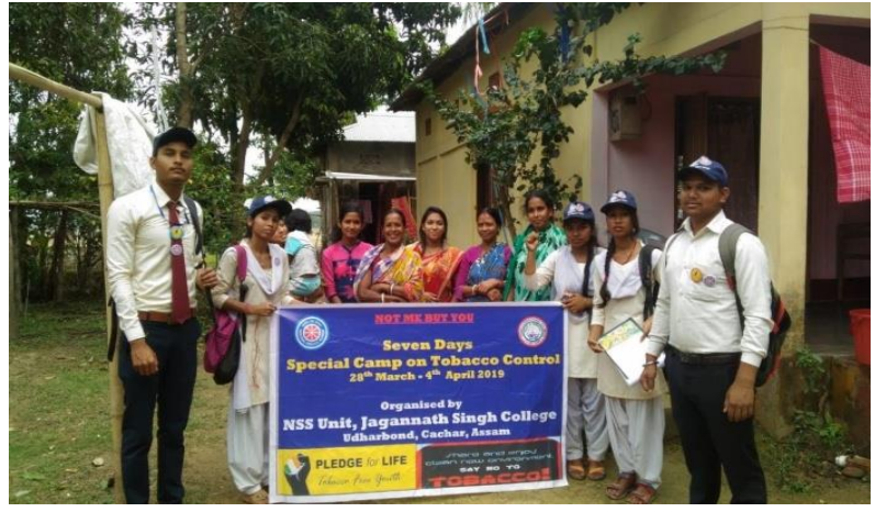
Door to Door Visit of the Volunteers for anti-tobacco Awareness