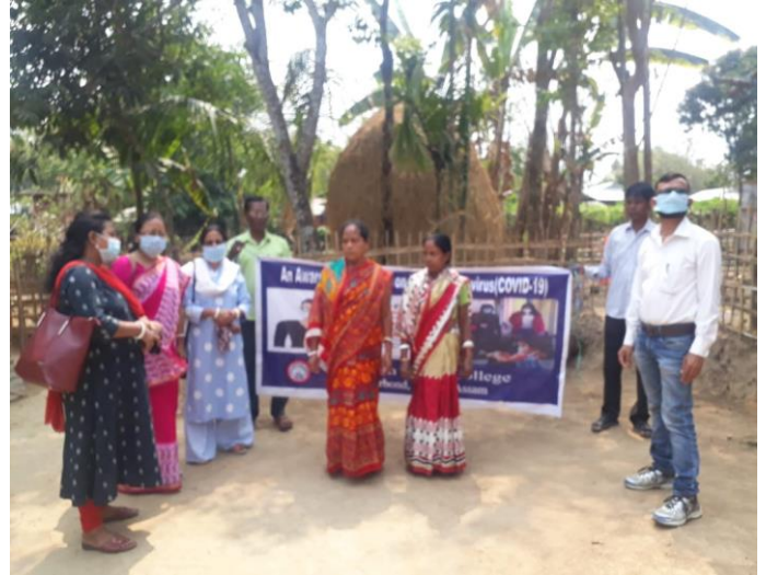
Awareness on Covid-19 among the Rural Folk.