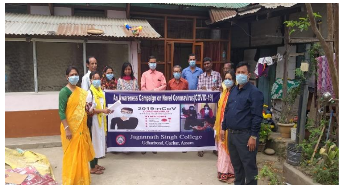
An Awareness Campaign on Novel Corona Virus in Durganagar Village