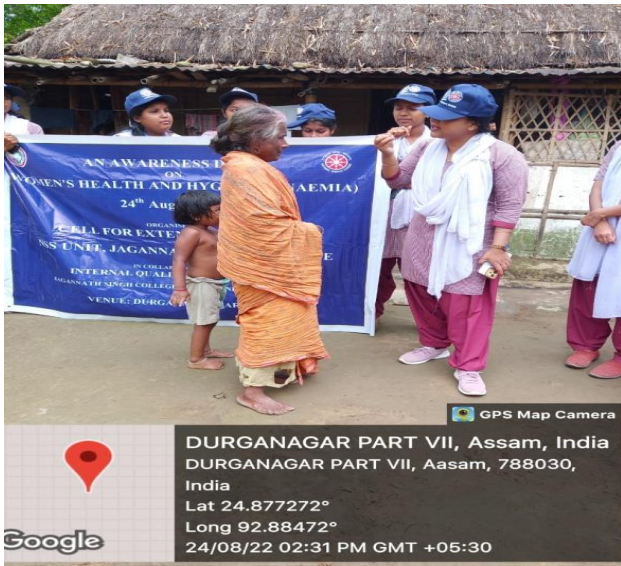
Awareness Program on Anaemia on 24/08/2022