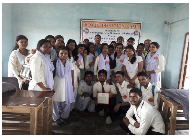
Voluntary Blood Donation Camp Date: 23.03.2018