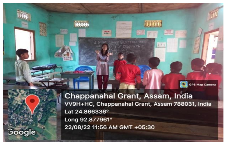
A drive under best practice on 22/08/2022