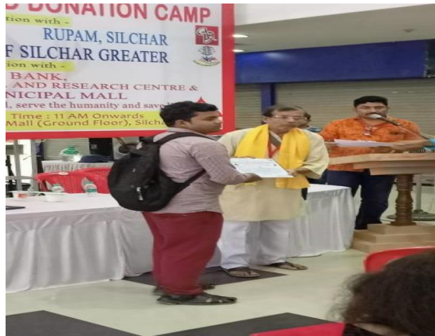
Voluntary Blood Donation Camp on Date: 25.09.2021